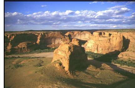
Canyon de Chelly