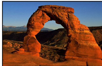
Arches National Park